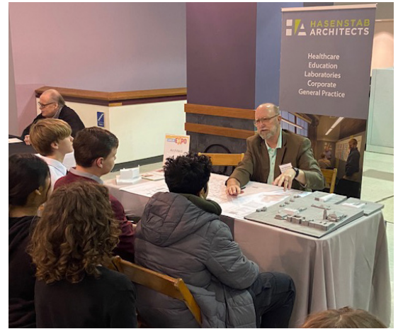
Contributing to a career exploration expo.