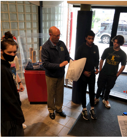
Working with students during an industry field trip to Hasenstab Architects.