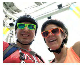
AIA National Conference Bike Tour, Las Vegas, NV, 2019