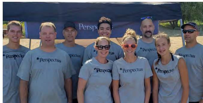
Perspectus Vollyball Team, AIA Cleveland Sandfest, 2019