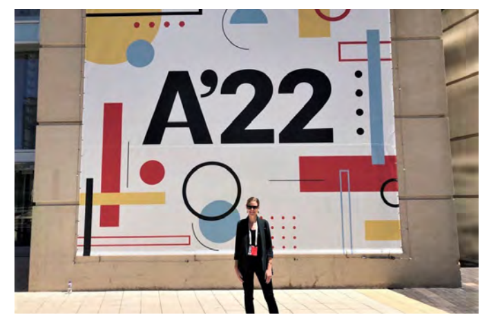
AIA National Conference, Chicago, IL, 2022