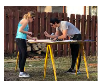
Prepping for CANstruction Build Night, 2022