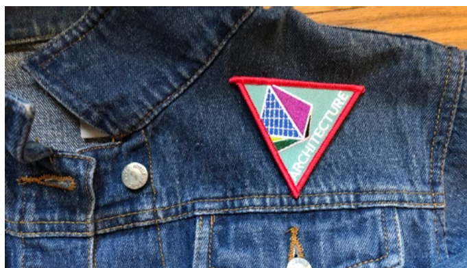
Girl Scouts of Northeast Ohio Architecture Patch