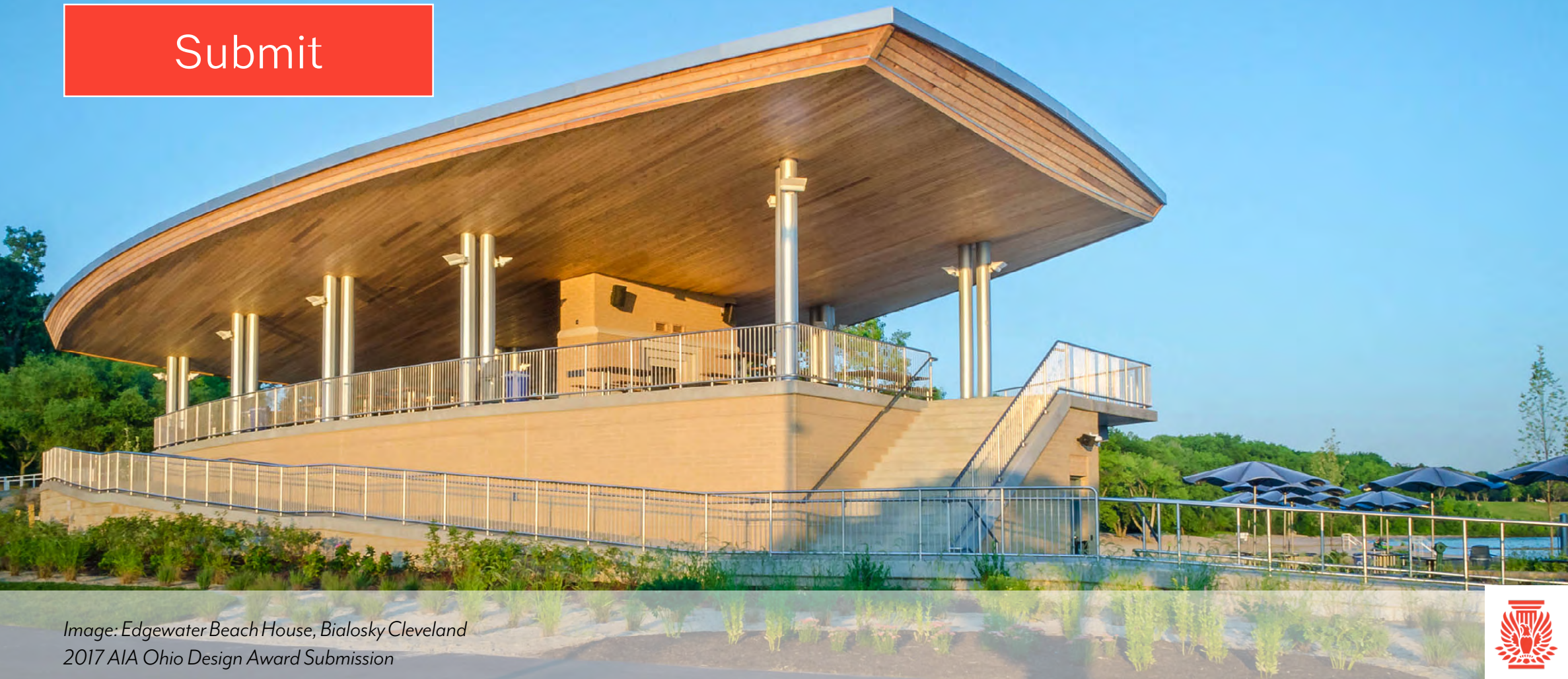
Image: Edgewater Beach House, Bialosky Cleveland 2017 AIA Ohio Design Award Submission