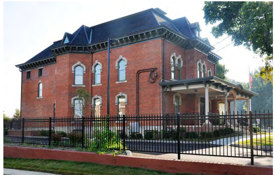
OHPTC Project: Andrew Jackson House (Akron, Ohio) | Dimit Architects